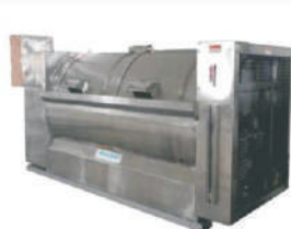
Horizontal washing machine