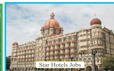
Star Hotels Jobs