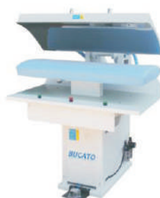
Flat bed press