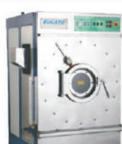
Vertical washing machine