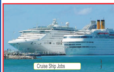
Cruise Ship Jobs