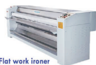
Flat work ironer